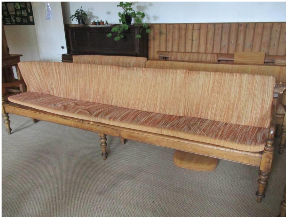
Figure 2: Open-backed pine benches in main meeting room

The foyer contains a table with inkwells associated with the building's use as an Adult School at the beginning of the twentieth century. In the meeting room is a centre table by Alan Grainger c.1970s. The seating consists of open-backed pine benches with turned front legs and arm supports, simple benches with shaped bench ends.